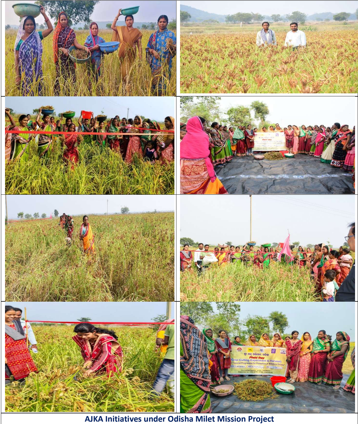
AJKA Initiatives under Odisha Millet Mission Project