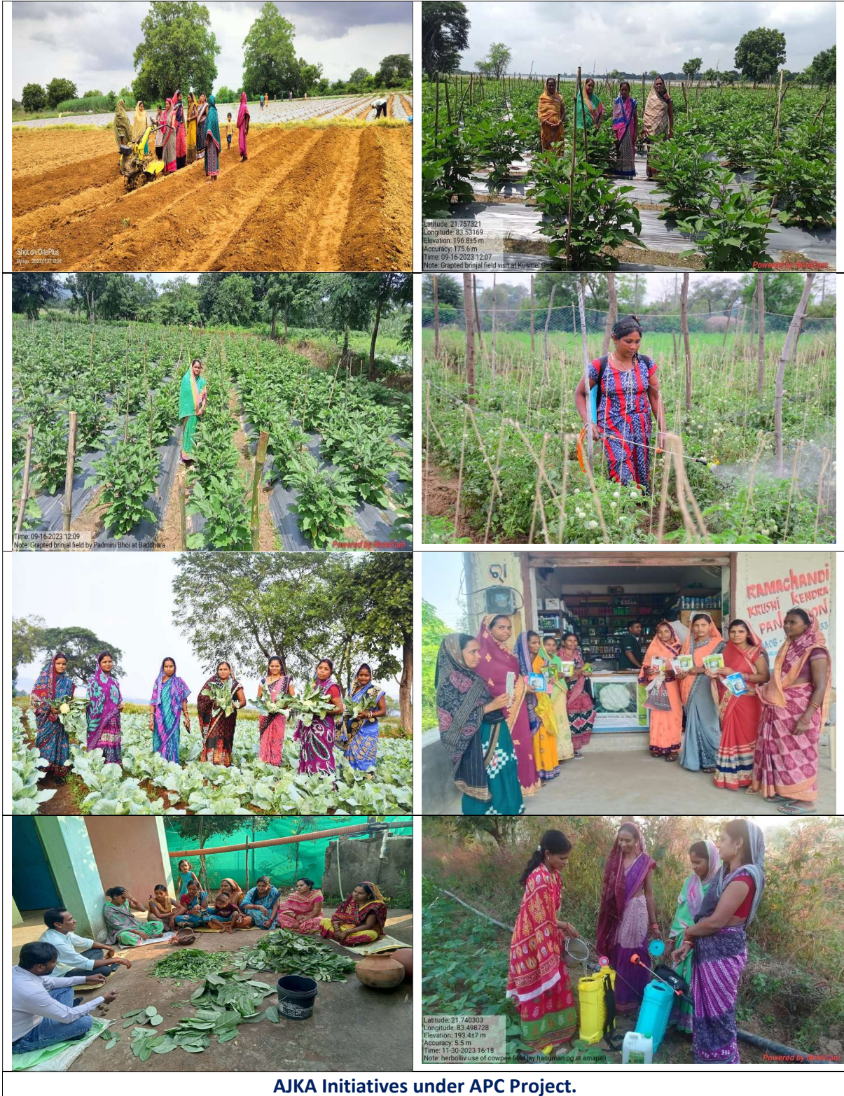
AJKA Initiatives under APC Project.