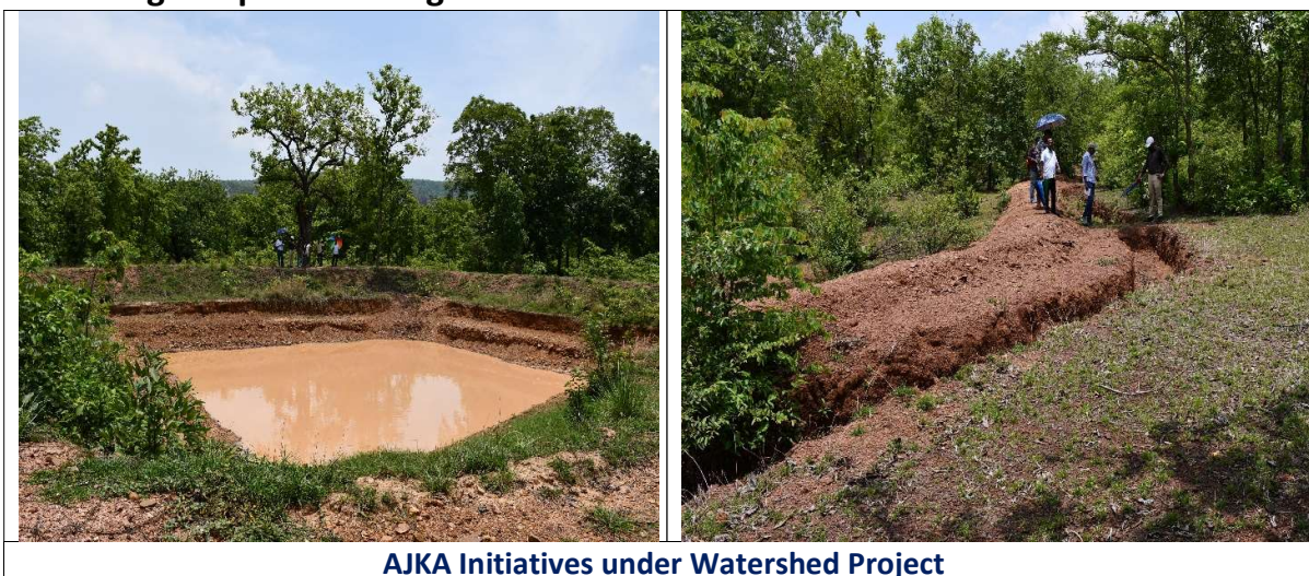
AJKA Initiatives under Watershed Project